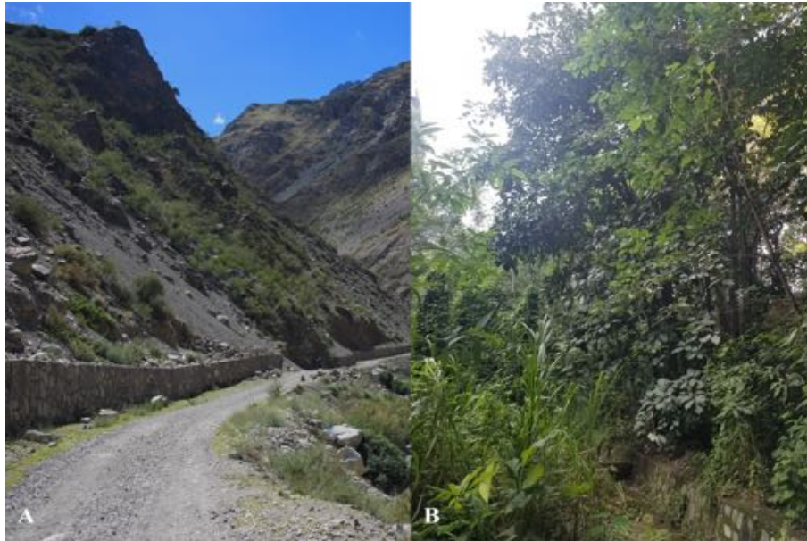
Figure 6 The habitats at the type locality of Lycodon serratus sp. nov. near Geyading Village, Deqin County, Yunnan Province, China (A) and L. obvelatus sp. nov. in Panzhihua City Park, Panzhihua, Sichuan, China (B)

populations in different river valleys are allopatric to each other, despite the short linear distance among them (Figure 1). Therefore, it is likely that nearby valleys along the upper Mekong, Salween, and Yalong Rivers also harbor additional undiscovered diversity of the genus Lycodon . Further surveys are needed to better inventory of the reptilian diversity and assess their conservation statuses in the northern HMR.