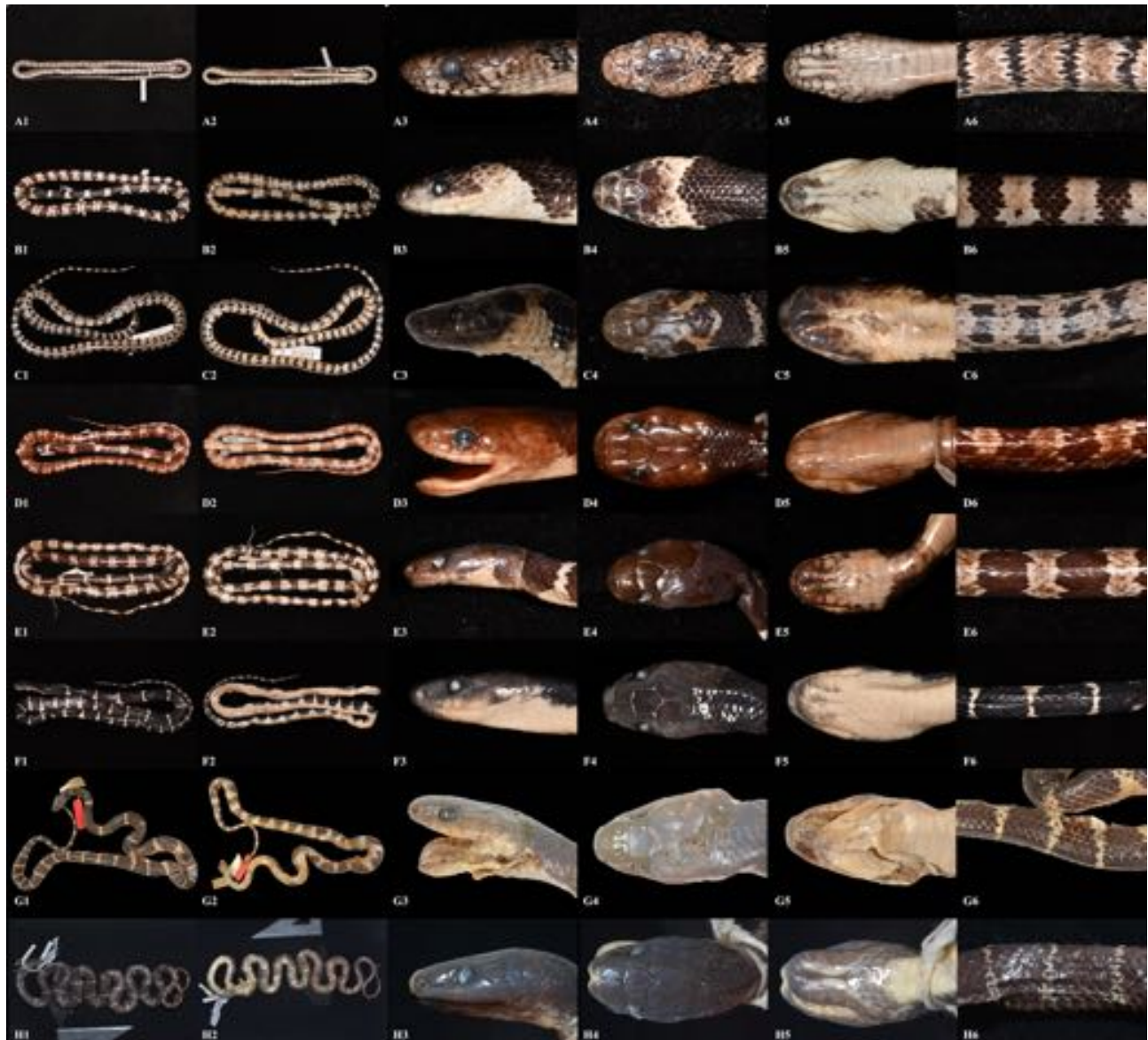
Figure 5 Comparisons of (1) dorsal overview, (2) ventral overview, (3) lateral head, (4) dorsal head, (5) ventral head, and (6) dorsum close-up among Lycodon serratus sp. nov. (KIZ 038335; holotype) (A), L. obvelatus sp. nov. (KIZ 040146; holotype) (B), L. multizonatus (KIZ 01623; topotype) (C), L. fasciatus (KIZ 74110262) (D), L. gongshan (KIZ 730034; holotype) (E), “ L. septentrionalis ” (KIZ 035594; from Dali, Yunnan, China) (F), L. chapaensis comb. nov. (MNHN-RA-1933.0011, holotype; from Chapa, Tonkin, Vietnam) (G), and L. septentrionalis (CIB 117521; from Medog, Tibet, China) (H)

midbody (17 vs. 19); and from L. ophiophagus by having a shorter tail (TaL 17.1%–18.4% vs. 20.1%–22.8%).