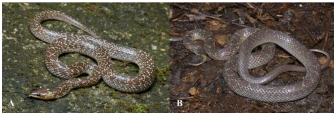
Figure 7 Photos of live Lycodon aulicus-capucinus complex from China

Updated key and distribution of the genus Lycodon in China: To facilitate future taxonomic studies of the genus Lycodon in China, we provide an updated dichotomous key and the distributions of the 20 recognized species of Lycodon species in China. The distribution data are based of Zhao et al. (1998) and are further modified with new findings in this present study and additional literatures published after 1998 (Appendix III). “?” indicates possible but not yet confirmed records based on photographic evidence or published sequences with vague locality and no morphological data; and “!” indicate possible erroneous records that warrant future