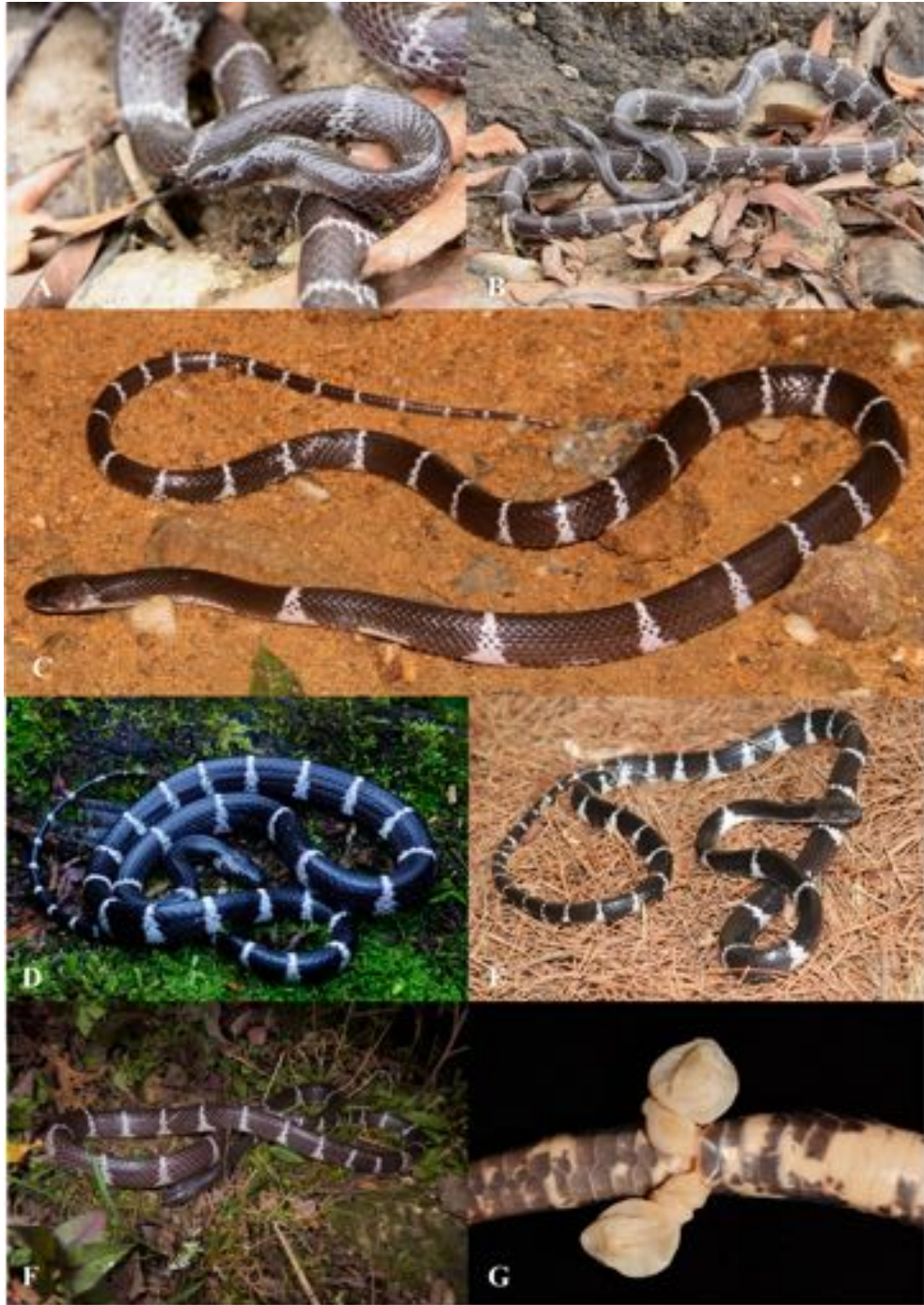
Figure 3 Comparisons between true Lycodon septentrionalis (A, B); L. namdongensis (C), and Yunnan specimen of “ D. septentrionalis ” (D–G)