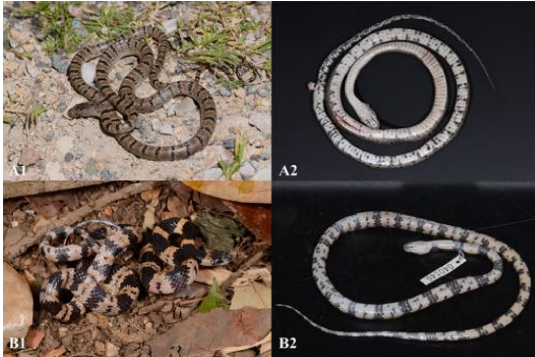
Figure 4 The dorsolateral view (1) and ventral view (2) of the holotype of Lycodon serratus sp. nov. (KIZ 038335) (A) and L. obvelatus sp. nov. in life (KIZ 040146) (B)

027593, male from Tengchong, Baoshan, Yunnan, China; KIZ 038282, male from Fugong, Nujiang Prefecture, Yunnan, China; and KIZ 035045, subadult female from Lushui, Gongshan Prefecture, Yunnan, China.