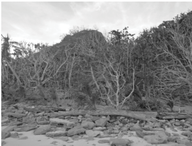
Fig. 4 Rogua Beach on Monuriki in March of 2016 after Cyclone Winston. Broken and denuded trees are seen along the beach and up the hillslope.