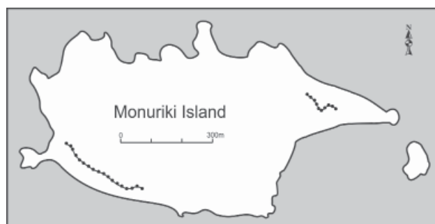
Fig. 3 Monuriki Island showing the transects with the rat sampling stations on the west and east beaches.

Between February and June 2017, 35 wild iguanas (not passing through captivity) were caught and marked. Many