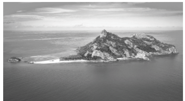
Fig. 2 View of Monuriki Island from 2017, looking to the south-west.